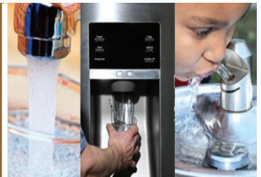
Tap | Fridge | Fountain

A growing number of businesses are turning to bottleless drinking water systems for their advanced filtration capabilities, providing purified, healthy, and unlimited drinking water.